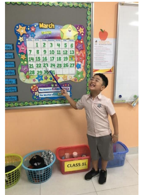
1L – Starting the day off right by looking at the date and the weather.