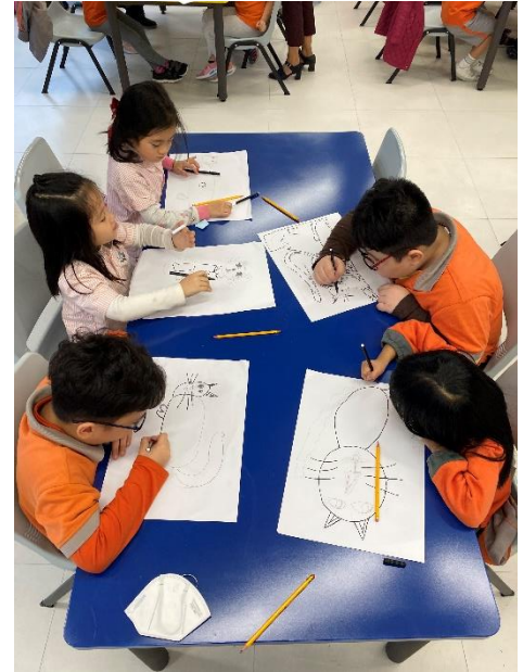
ART Club Students from 1C enjoying their first Art Club lesson while producing their very own masterpieces.

Congratulations to this month's Critical Thinkers!