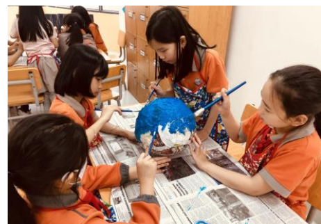
The Students of 4C putting the finishing touches on their paper mache globes.