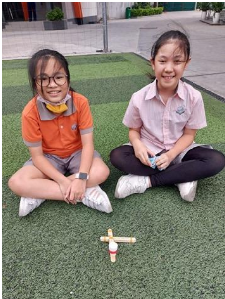
4L Science Students having fun while experimenting with different forms of energy. Here we see students testing their Popsicle Stick Catapults.