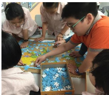
5L Students are studying the continents and oceans and were working on a 500-piece puzzle on the continents and oceans of the world. Puzzles develop self-confidence, focus, problem solving and reasoning.

This month our students focused on the virtues of Self-Discipline and Optimism. Our students have displayed great self-discipline while studying online, attending classes and doing their coursework from home. Now that we are all back together at school, we all share renewed optimism that each day will be better than the last!