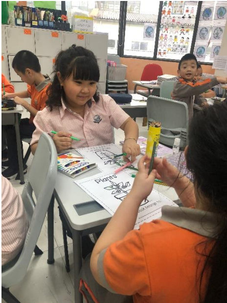
2B Students enjoying their STEM activity by making their plant booklets.