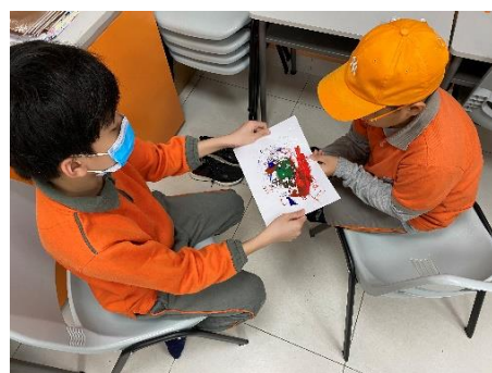
6L Students using magnets to paint pictures – showing us what happens when science meets art.

In class 3L we have "Writers Workshop" each week. In Writers Workshop, students learn important writing skills to help strengthen their story writing and bring their characters to life with voice and personality. Students use graphic organizers to help them organize their thinking and create an understandable sequence of events in their story. This week, our students are writing folk tales and learning about how a story can teach us an important life lesson.