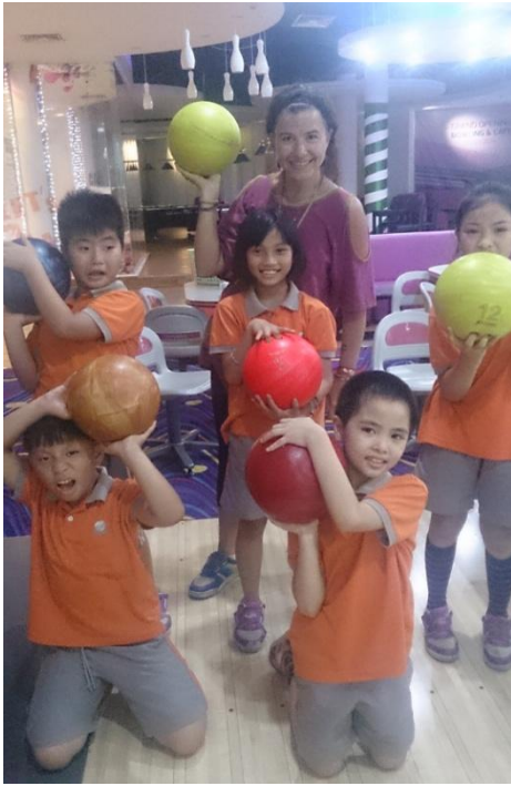
Year 3 having fun at Bowling center