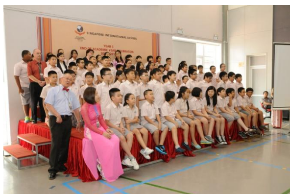
A performance by Year 5s at Leaving Ceremony