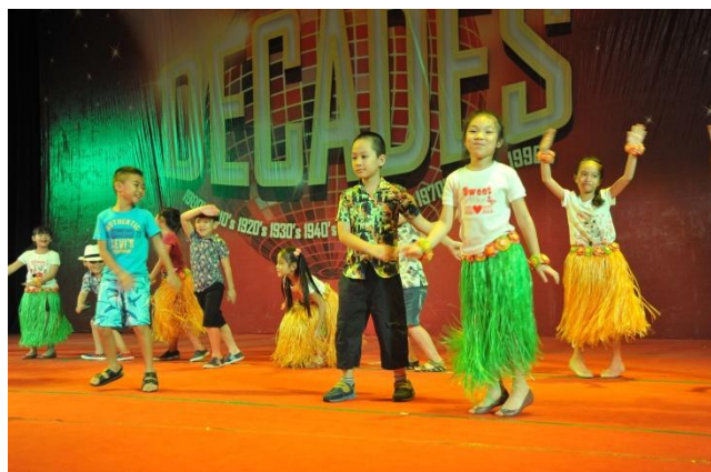
A performance at End of Year Concert