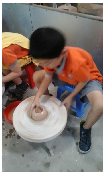
Year 3 student creates his own pot using clay

Written by the students of Year 1 International.