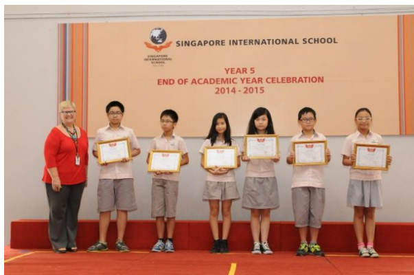
Awarding excellent students at Leaving Ceremony