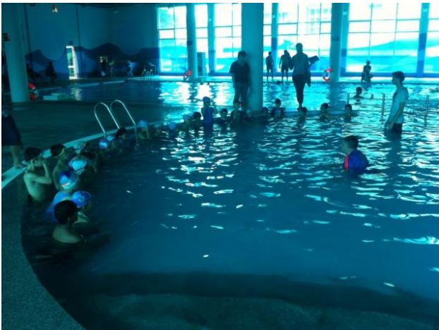
Students enjoy swimming in PE lesson

Watching these young students pick up bowling balls almost their size and attempt to roll them down the lane was quite funny, watching everyone with a smile on their faces! Then a student would get a strike or a spare! The rest of the crowd roared with cheers and laughter. The true wonder of this excursion was when we came back to school the following day, and a handful of students made arrangements to go bowling with their families! All in all it was a wonderful time at the bowling lanes, and all students learned to have fun in an activity that the whole family can play!