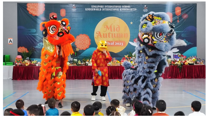
The Lion Dance was exciting and majestic.