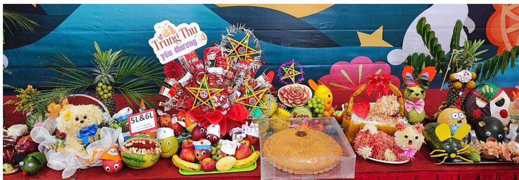
Beautiful fruit tray displays made by students in celebration of the Mid-Autumn Festival.