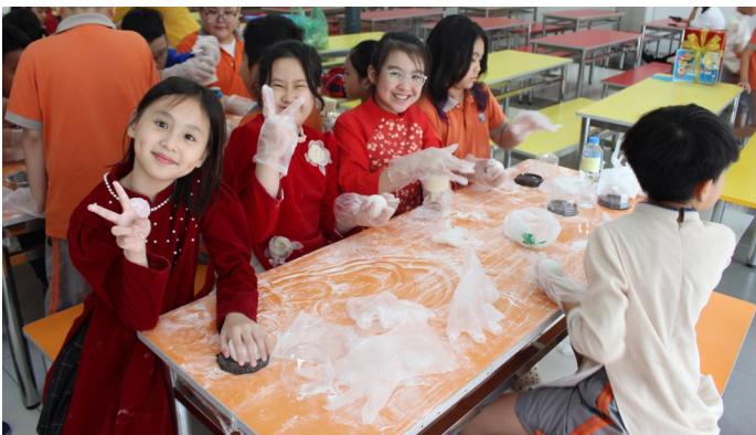
All students really enjoyed the moon cake making experience.