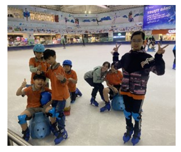
The 6L class took an excursion to the Vincom Ice Rink in Royal City. They had so much fun practicing their ice skating skills together.