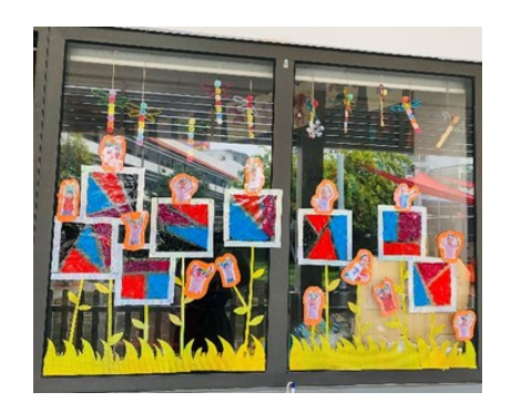
K1A Dragonflies Class

"Mathematics is the art of giving the same name to different things."