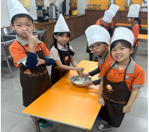
Students in 3A and 3B took an excursion to Pegasus International Collage where they learnt how to make their own Hawaiian pizza and were taught about food hygiene and safety in the kitchen.