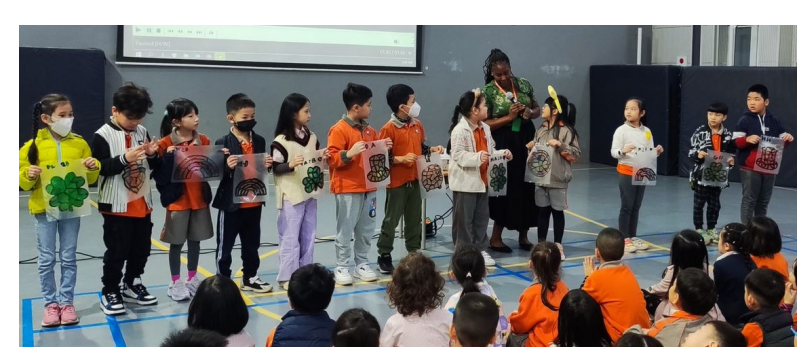
2B got into the St. Patrick's Day spirit by creating these amazing suncatchers with designs including shamrocks, rainbows, and top hats.