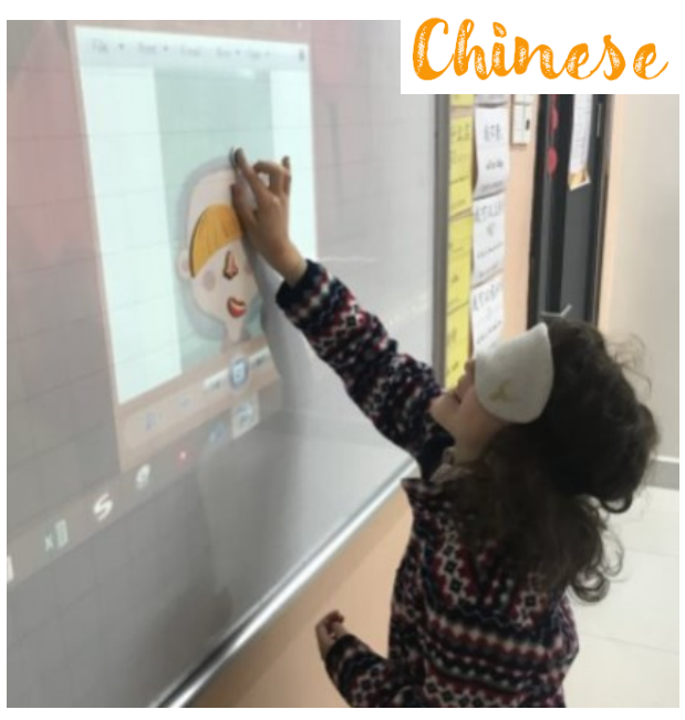
1L students learned body parts vocabulary in this lesson. One student was blindfolded while other students gave clues to help her find the correct placement of puzzle pieces.

T: (84-24) 7304 2777 E: www.vanphuc.sis.edu.vn