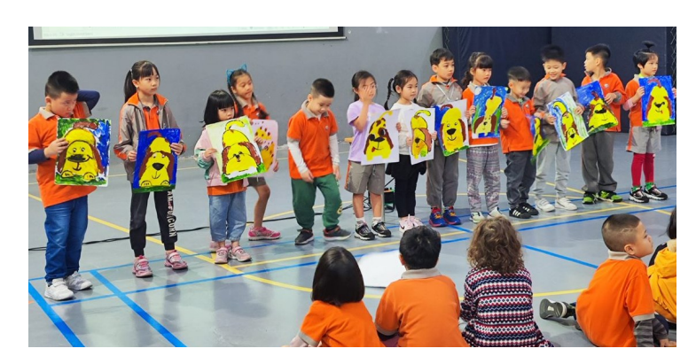
In 1A, students learned how to use semi-circles to create a dog in a step-by-step drawing lesson.