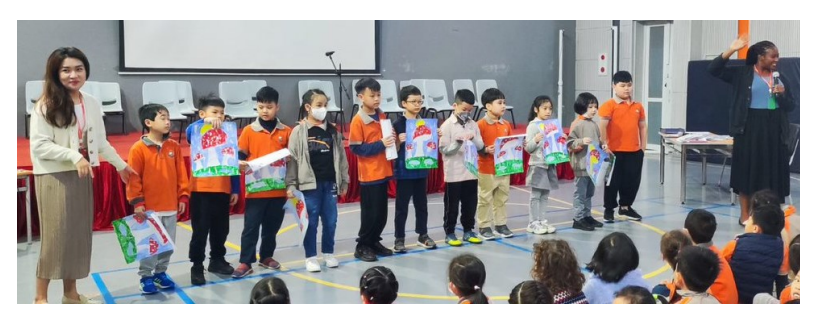
Students in 2A practiced using a variety of shapes to draw a scene nature scene depicting a mushroom and a snail.