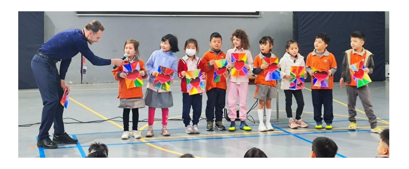
In 1L, students drew these beautiful heart shapes and experimented with multi-coloured backgrounds.