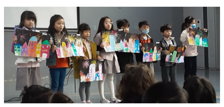
2L students showed off their colourful firework-inspired paintings.