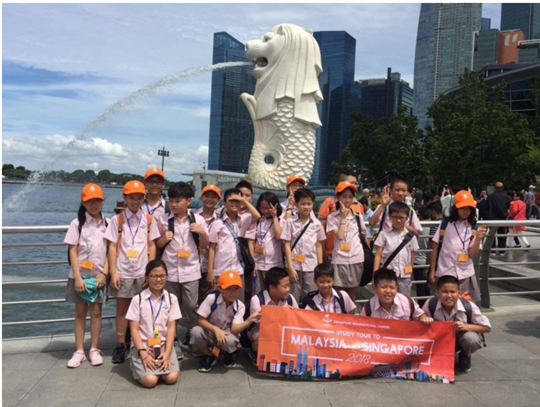
A photo taken during the Study Tour in Malaysia and Singapore in 2018.