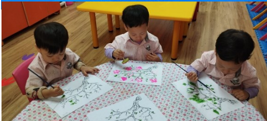
Nursery students are painting peach blossoms.