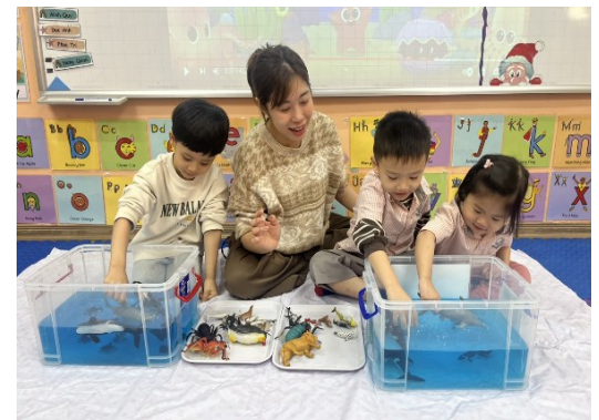
Theme activities-Ocean Animals

In our Language lessons, the children engaged in naming and discussing various ocean animals. They had the opportunity to select ocean animals and drop them into the water.