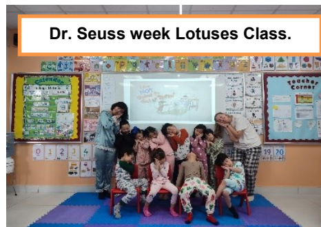
Dr. Seuss week Lotuses Class.

The month's highlights were our exciting school excursions. Different classes visited various places, such as Chimi Farm, Erahouse, My Little Gym, and The Creative Gara. These outings provided unique learning experiences, and all the students had a great time.