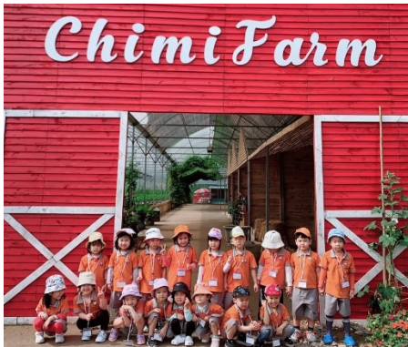
Lilies class – Excursion to Chimi Farm.