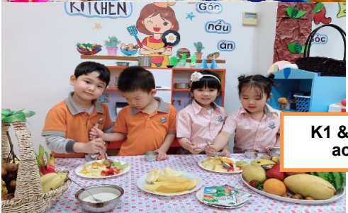
K1 & K2 theme activities.