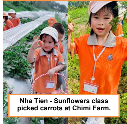
Nha Tien - Sunflowers class picked carrots at Chimi Farm.