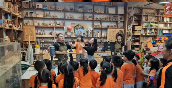
Lavenders students had a fantastic time at Creative Gara.