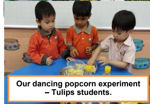
Our dancing popcorn experiment – Tulips students.