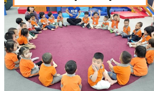
Our Tulips & Roses students were at My Little Gym.

Daisies students eagerly grew their own flowers, learning about flower parts and photosynthesis. They took on the responsibility of watering and caring for their flowers, fostering teamwork and a sense of ownership.