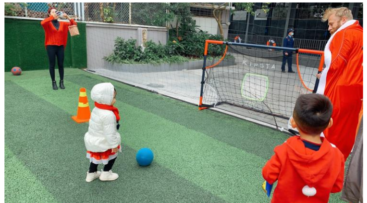
KIK Students lining up to shoot a goal and win prizes at our Christmas Charity Fair.