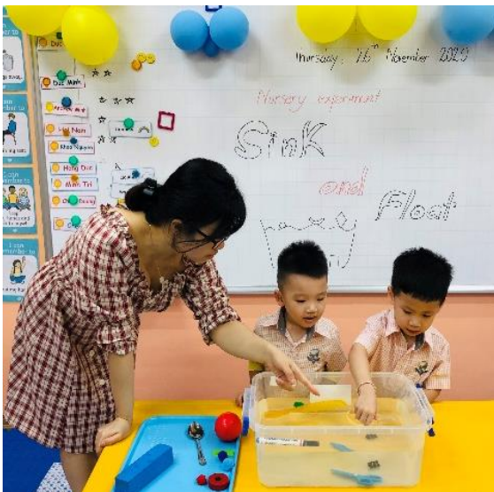
Nursery – Lion Class in Float & Sink Activity.

The students in Lion class explored the question, “Why do some things sink and some things float?” One might think that bigger things sink and smaller things float, but in the weird and wonderful world we live in, that’s not always true!