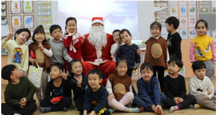
K2 - Giraffe Class meet jolly old Santa Claus.

It was mesmerizing to watch how colour patterns formed in this experiment. We only needed three simple ingredients, a minute to set it up, and we had an exciting activity to observe and reflect upon.