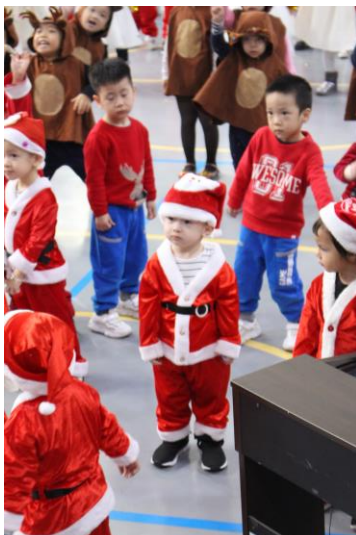
Our adorable KIK students dressed and ready to perform for our Christmas Concert.