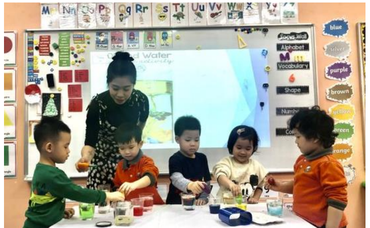
K1 – Bunny Class learn about mixing compounds.

Students performed this Sink & Float experiment by using a variety of objects from around our classroom such as: spoons, pencils, paper boats, foam, plastic balls, and wood.