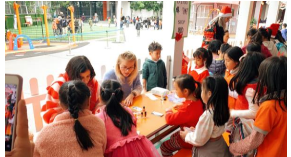
Students waiting in anticipation (above) for some lovely and decorative nail art (below).

While we were not celebrating in our usual way, this year's Christmas Charity Fair was still a wonderful success! Our students enjoyed delicious foods and had hours of fun playing games and doing crafts. This holiday season is one of the best times to share with those less fortunate than ourselves through charitable acts. Fortunately for everyone, our students were able to have a great time while helping others!