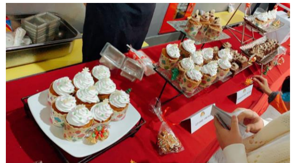
Delicious treats to satisfy your sweet tooth.

Sports, crafts, games and skills....we hope everyone is getting ready for our upcoming After-School Activities! Term 3 ASA begins next month and will run from February 22 nd to April 2 nd . We will send home a sign-up form in the next few weeks.