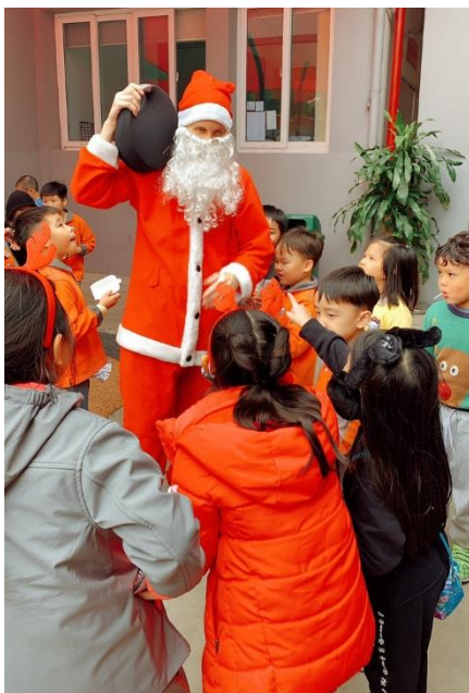
Jolly old Santa Claus spreading Christmas cheer