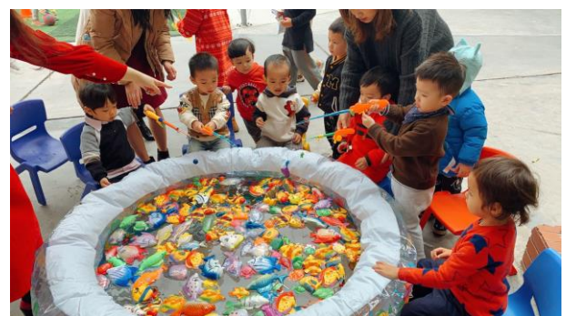
KIK students try their hand at fishing.