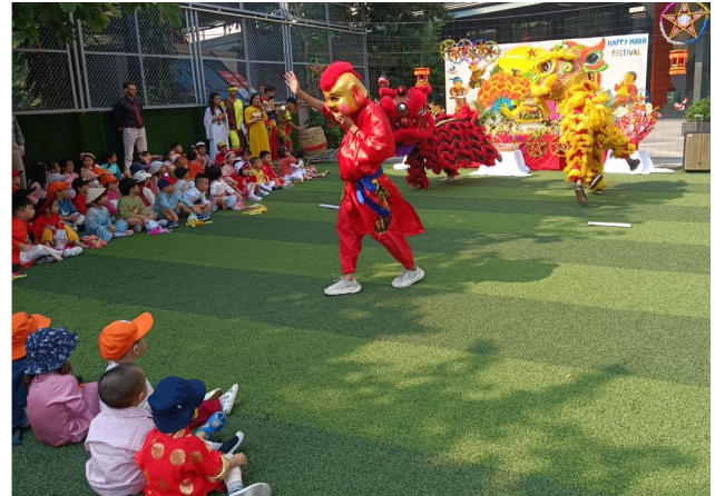
The Lion Dance was exciting and majestic.