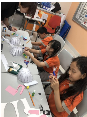
Students of 2L made lovely lanterns for the festival.