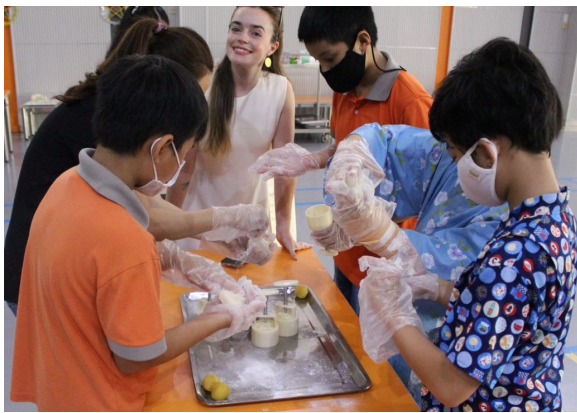
6L students enjoyed learning how to make mooncakes.