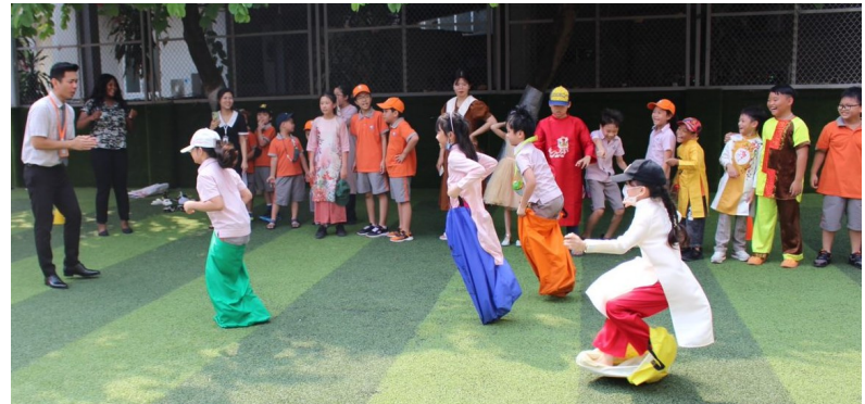
The tug-of-war and sack race games were a big hit with everyone.