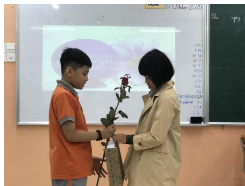
Year 5 students showed gratitude on Vietnamese Women's Day

The Year 3's took the Year 1's outdoors for paired reading. The classes thoroughly enjoyed listening to one another read and are becoming Confident Communicators!