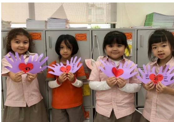
Year 1C students made beautiful cards to give to their moms on Vietnamese Women's Day.