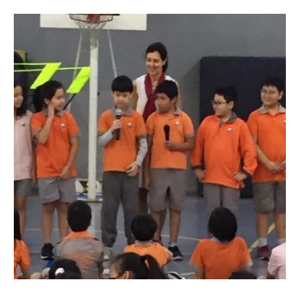
4B Assembly Presentation on the Virtue Responsibility where each student spoke about how they show responsibility in their daily lives.