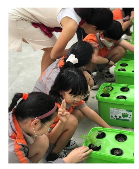
5B students planted seedlings We definitely have some green-fingered children among us!