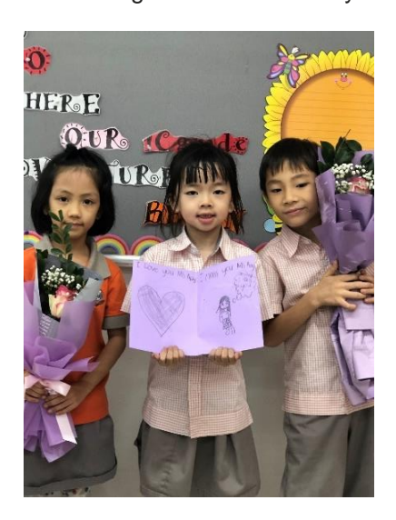
1C Students showing their love for teachers