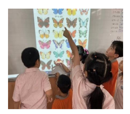
Class 3L is working on a project STEM about camouflage. They are learning about how patterns can help animals blend with their surroundings and hide from predators. To try and figure out HOW they do it, students selected their own butterfly patterns to draw and created a background image to help their butterfly blend with the background!