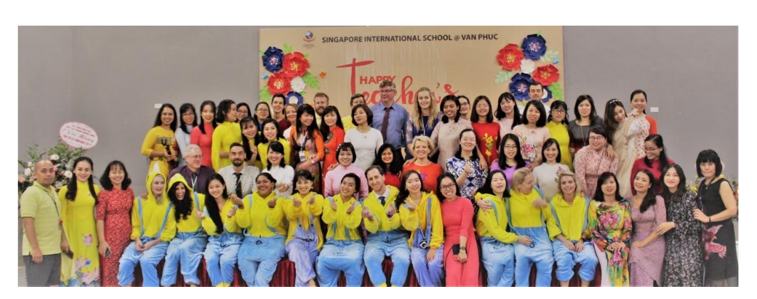
November 20th Teachers' Day Celebration

Congratulations to our most Technologically Literate Students!