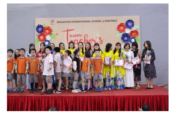
Happy Teachers' Day to all lovely KIK teachers at SIS Van Phuc.

Please be sure to check your child(s) updated class story on ClassDojo for further information.