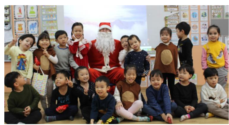
K2 - Giraffe Class meet jolly old Santa Claus.

Students performed this Sink & Float experiment by using a variety of objects from around our classroom such as: spoons, pencils, paper boats, foam, plastic balls, and wood.