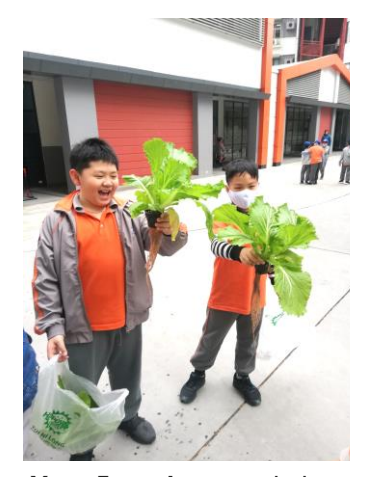
Year 5 students took the fruits of their labour home this month. Some of them had grown to quite an impressive size!