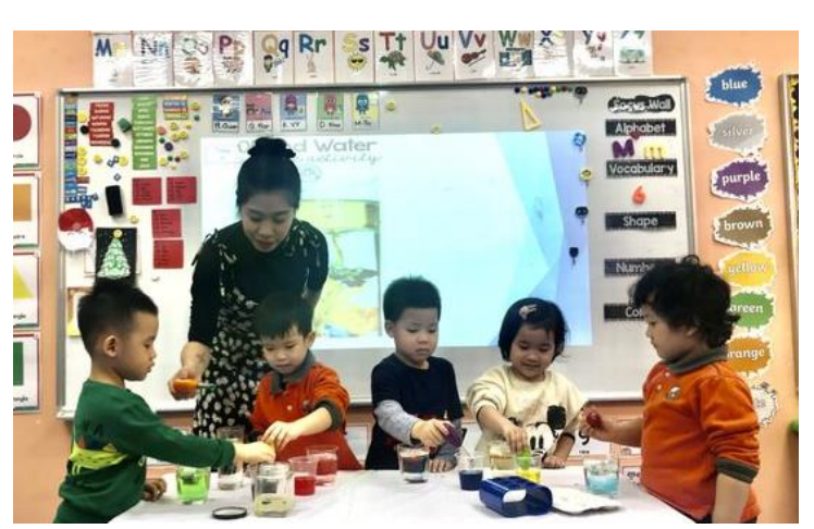
K1 - Bunny Class learn about mixing compounds.