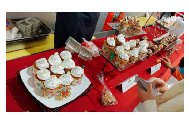
Delicious treats to satisfy your sweet tooth.