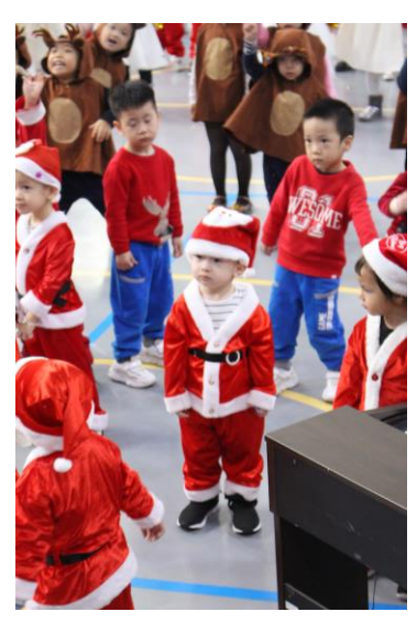
Our adorable KIK students dressed and ready to perform for our Christmas Concert.