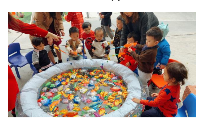
KIK students try their hand at fishing.