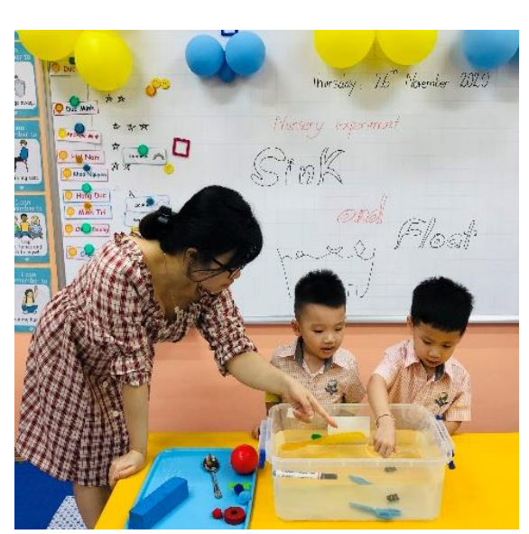
Nursery - Lion Class in Float & Sink Activity.

It was mesmerizing to watch how colour patterns formed in this experiment. We only needed three simple ingredients, a minute to set it up, and we had an exciting activity to observe and reflect upon.