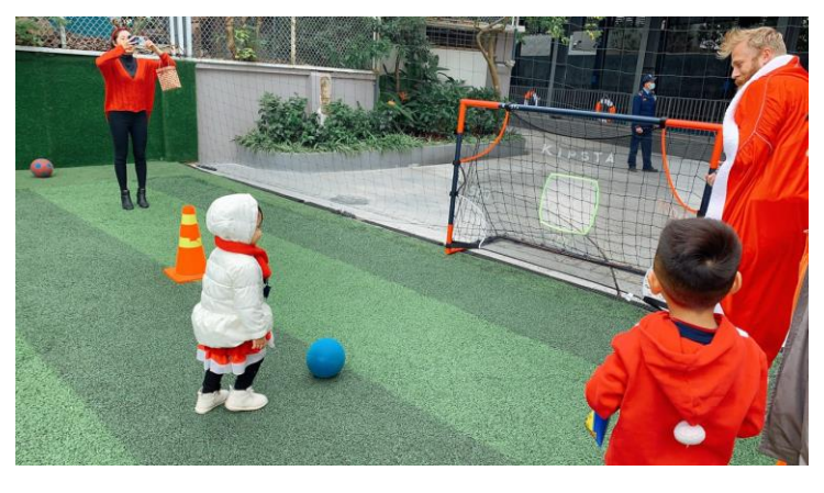
KIK Students lining up to shoot a goal and win prizes at our Christmas Charity Fair.