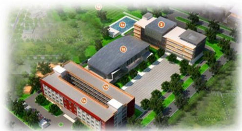
Singapore Vietnam International Academy Multi-Level School @ Nha Trang

In Hanoi, mass piling work of SIS Super School @ Gamuda Gardens is completed and the school will commence its operations in the second Quarter 2015.