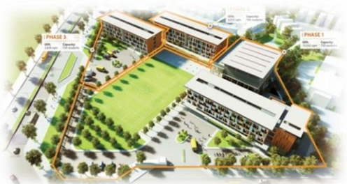
SIS Super School @ Gamuda Gardens, Hanoi