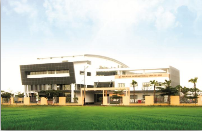
Pegasus International UniCentre at Danang