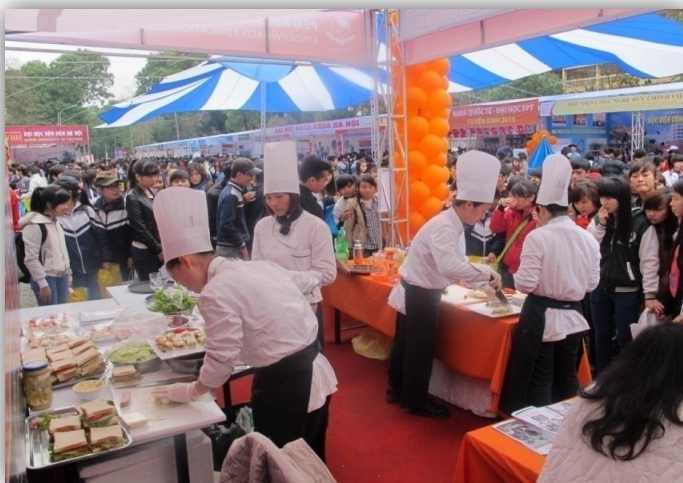
Open Day 2014 in Hanoi