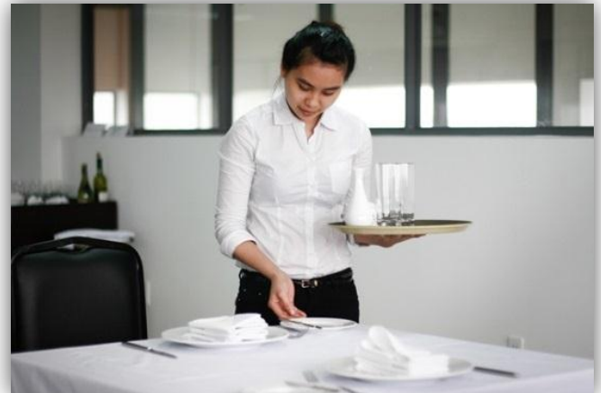
Restaurant Operations practice period in the VTOS Training from 6th – 17th January 2014

The Vietnamese Pegasus International UniCentre (PIU), Danang successfully hosted training courses in Restaurant Operations and European Cuisine based on the Vietnam Tourism Occupancy Standard (VTOS) from 6 January to 17 January 2014. These were provided as a complimentary offering to four and five-star hotels and resorts in Danang City and Hoi An Ancient town such as Hyatt Regency Danang Resort & Spa, Crown Plaza, Furama Resort, Grand Mercure and Palm Garden Resort. The courses enabled staff to experience the VTOS program and practice with the modern training facilities of PIU, Danang.